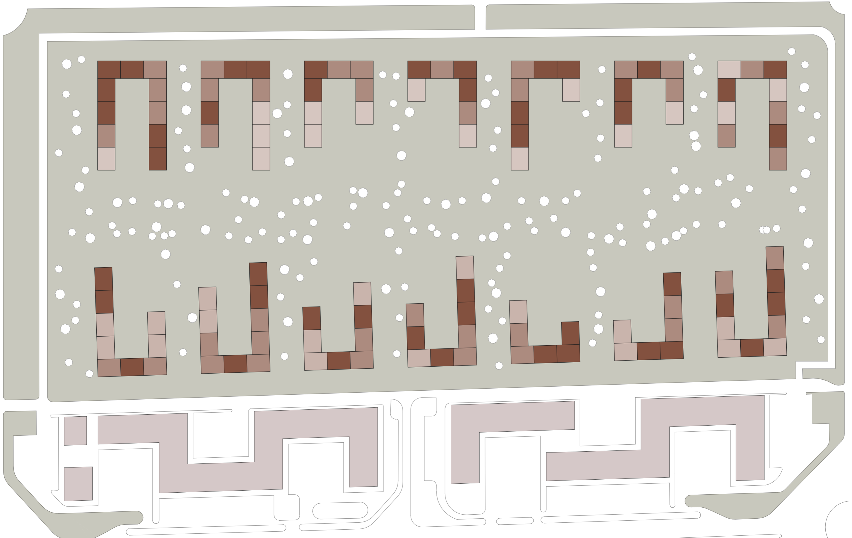
SITE PLAN 1:2000