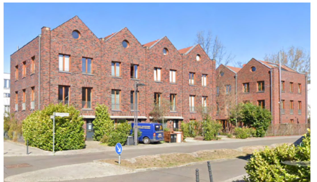
Kosanke Siedlung, Rummelburg, Berlin